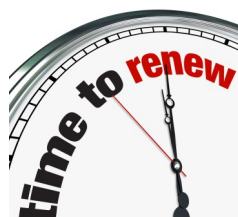
Renew your Membership