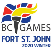
BC Winter Games Trials