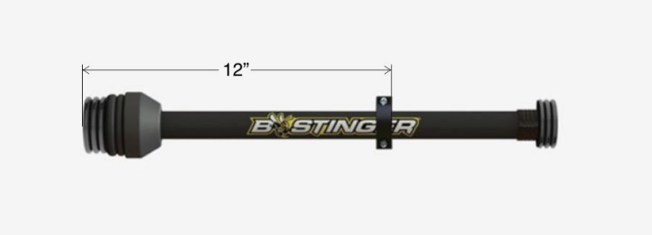
Approved by the Archery Canada Rules Committee, 8 December 2020