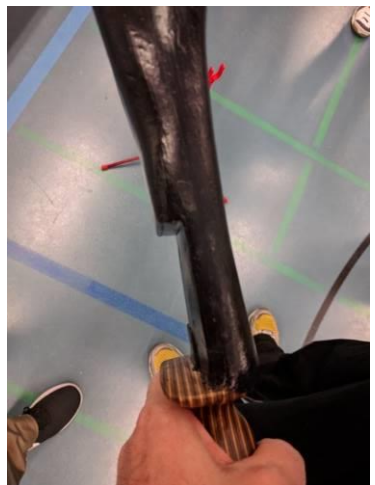
INTERPRETATIONS OF RULES