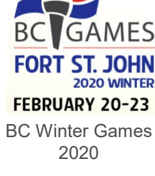
BC Winter Games 2020