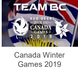
Canada Winter Games 2019