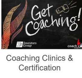
Coaching Clinics & Certification